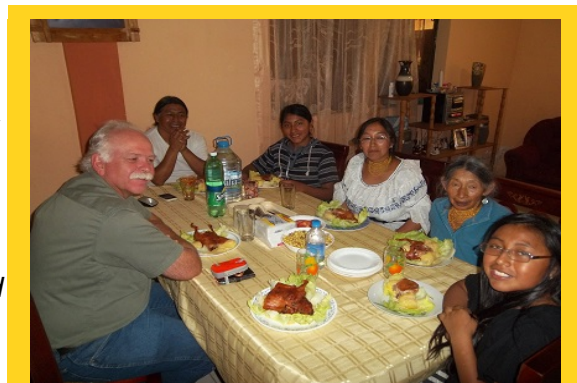
Enjoying a Guinea Pig Meal with Indigenous Friends