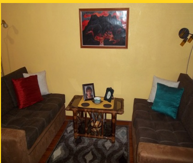
Adding Colorful Decorative Pieces