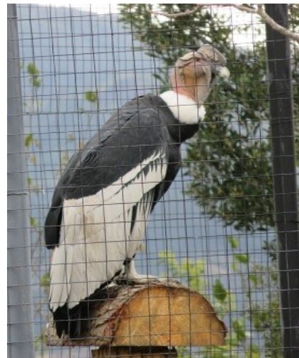
Andean Mountain Condor

We thank the Lord for the amazing time we spent together in ministry, as well as while spending time in God's creation, learning about the indigenous people and their culture!