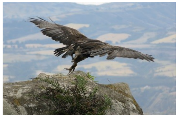
Bird of Rapture in Flight During Presentation

We also look forward to any future guests that the Lord may send us!