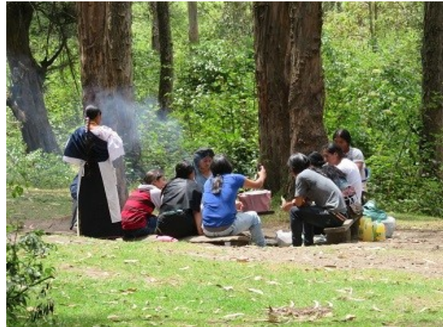
Indigenous Family Enjoying Peguche Park