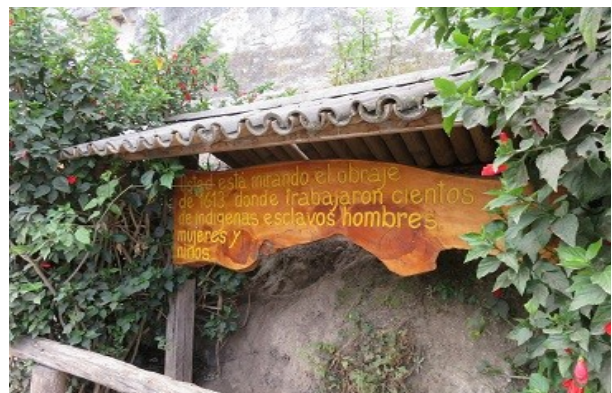
Memorial Site of the Enslaved Indigenous People