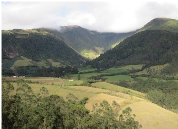
View from the Rose Cottage

Friday September 23 - Cheryl treated me to an overnight stay at The Rose Cottage, in the village of Otavalo, 2 hours north of Quito. Friday, we spent the afternoon walking through and shopping at the world famous Otavalo Market. (Cheryl did most of the shopping while I struck up conversations with the vendors and locals). Darrell joined us the following morning and took us to the Peguche Park/Waterfall and Condor Park to see a presentation of birds of rapture in flight.