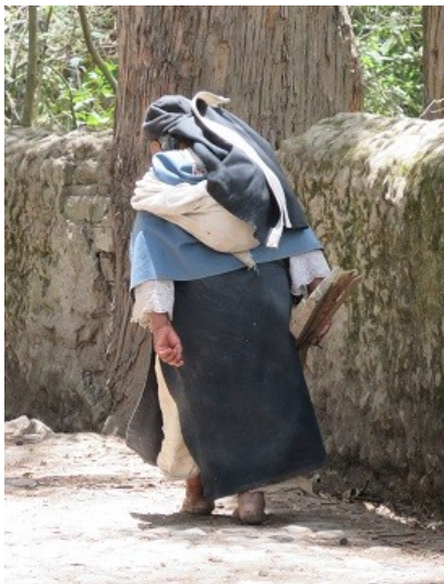
Old Indigenous Woman Walking Barefoot