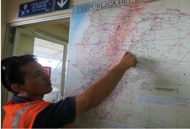
Map of Remote Areas Reached by Alas de Socorro

We were finally able to visit the Mission Aviation Fellowship hanger in Shell - now 'Alas de Socorro' (Wings of Rescue). We were blessed to see and hear how these pilots are reaching the remote areas of the jungle transporting missionaries, cargo, medical supplies, and Bibles to the tribal people groups. We'd like to share this amazing video with you! https://youtu.be/UfoFiMXv-3A