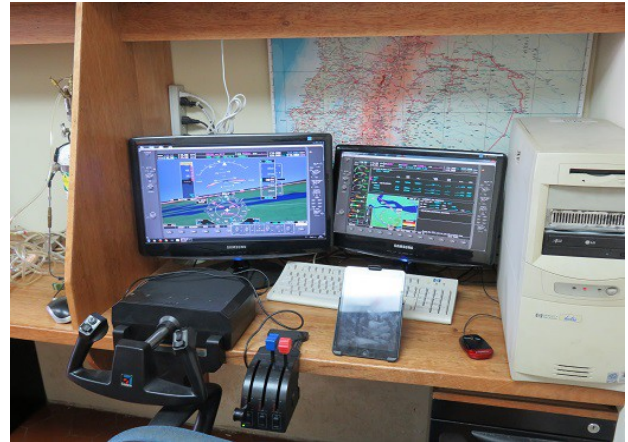
Pilot Training and Assimilation Stations