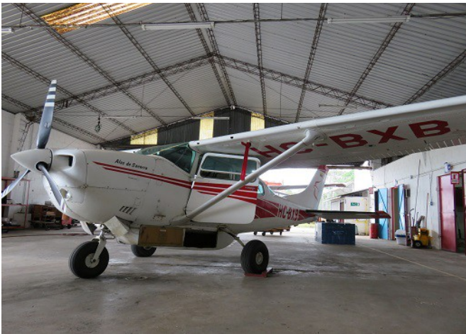
Aircraft Delivering Bibles to the Shuar Tribe - - >