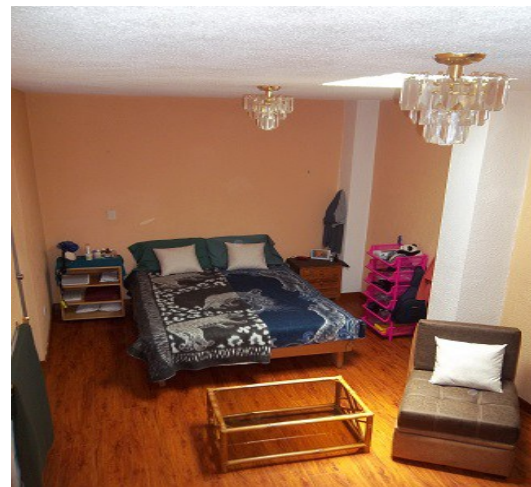
Our bedroom is beyond the glass kitchen door. It is 5 steps lower than the rest of our apartment. We are blessed to have 2 skylights in our bedroom! (But, also with bars!)

Despite having but only one window in our apartment through which to view of the outdoors (the view is only of a storefront and an alleyway), the vista from our rooftop brings us much pleasure. From there we can see the nearby mountains which our God has created and listen to the sounds of children playing in the nearby parks.