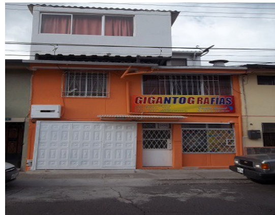
Our long, narrow apt is above the sign. We enter the building through a small door within the white garage door.