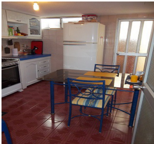
Our kitchen sits behind our living area. It has 2 sets of small obscure windows high up on the walls (with bars).