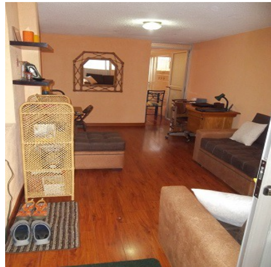
This room sits behind the den and serves as our living area and Darrell's office space. This room has no windows.