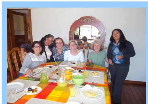
'Free Soul' ministry team meeting.