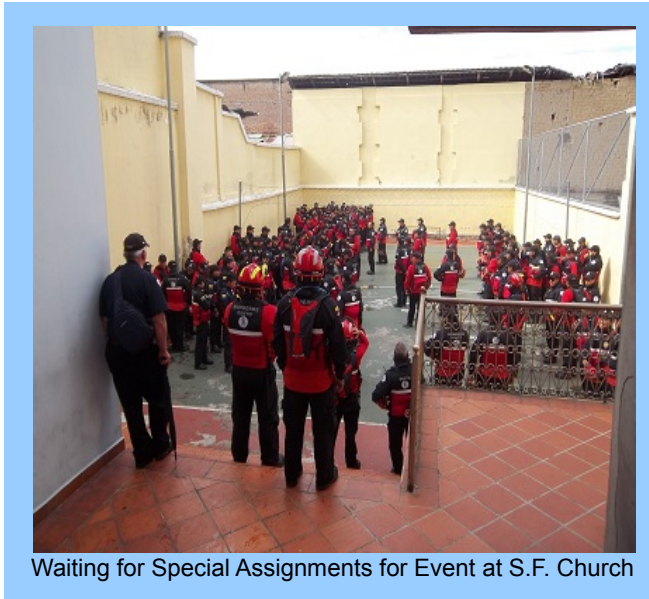
Waiting for Special Assignments for Event at S.F. Church