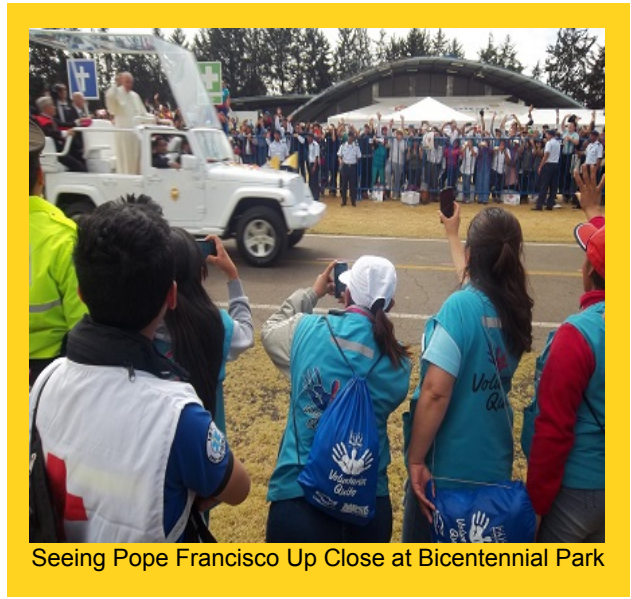
Seeing Pope Francisco Up Close at Bicentennial Park