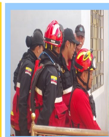
Mingling with Top Officers