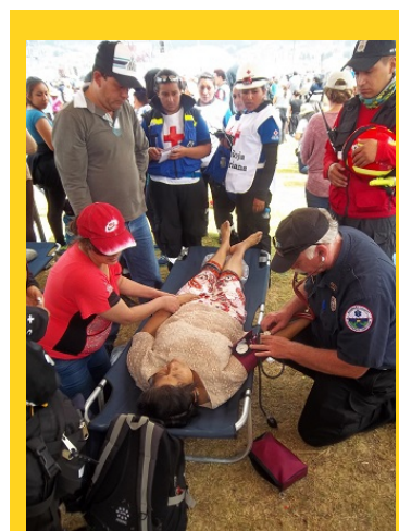
Ministering to Patients