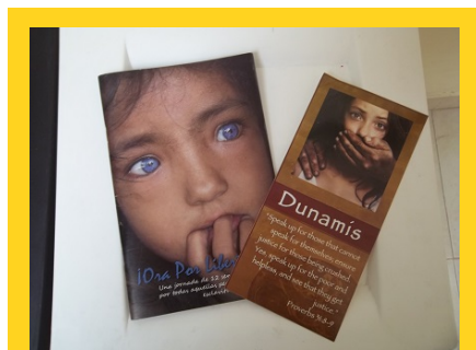
Ministry to young rescued prostitutes.