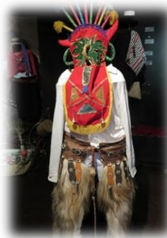
Tribal Mask and Clothing