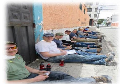
Daily Lunch on the Sidewalk