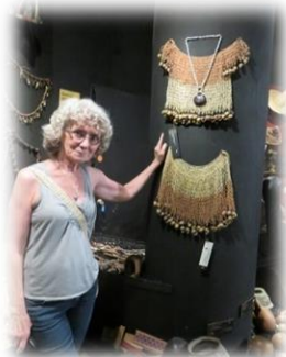
Women's Dress from Waorani Tribe