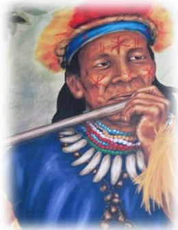
Painting of Man from Cofa'n Tribe

In early January, after all the busyness of the holiday season, one Saturday, we took a day trip to visit the Ethno-Cultural Museum and the San Francisco Church in Olde Town Quito.