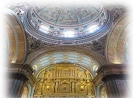
San Francisco Church Steeple Inside and Out