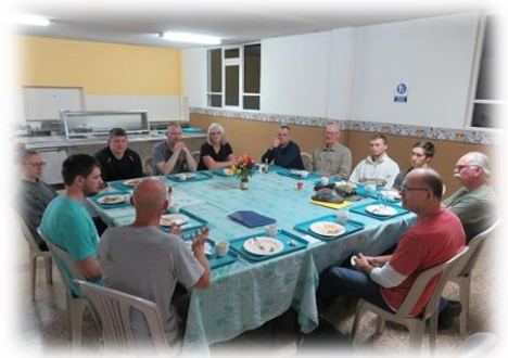
Team Meeting at Nazarene Seminary