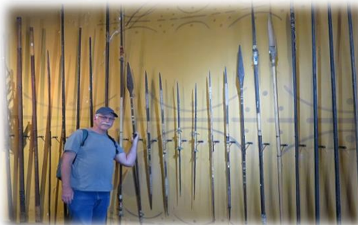
Spears Used to Kill Animals for Food or Human Enemies