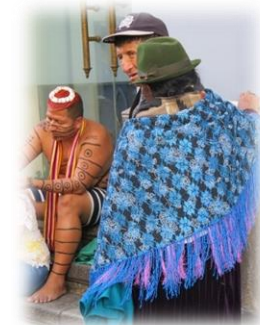
Shaman (left) Indigenous Lady (right)

It was a great get-away within the city of Quito and a time for us to relax a bit before starting our next mission project with the team that would come from Wisconsin later in January. We were blessed with a wonderful day of exploring, learning, and great weather. Then at the close of the day we found a quaint little restaurant with a touch of Old Spanish décor and enjoyed some live, romantic, piano music while feasting on the best lasagna we've ever eaten!