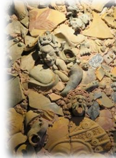
Incan Pottery Rescued from Recent Earthquake