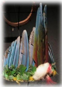
Tribal Head-Dress of Bird Feathers