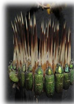
Tribal Head-Dress of Needles and Beetles