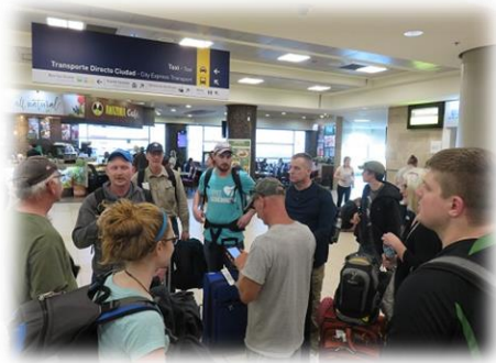
Team's Arrival at Quito Airport