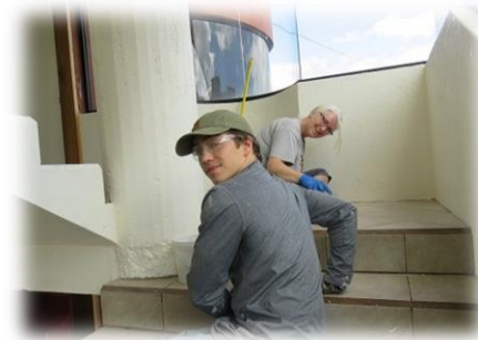
Young and Old Working Together