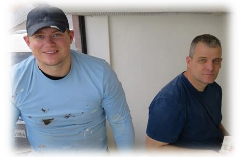
Deacon and Pastor Getting Dirty