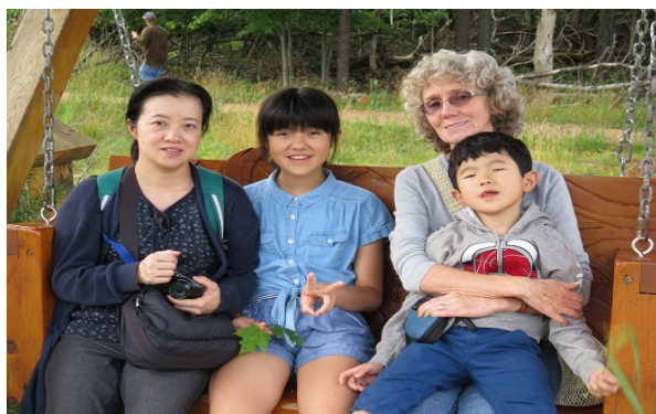
On a Swing at Schmeekle Reserve