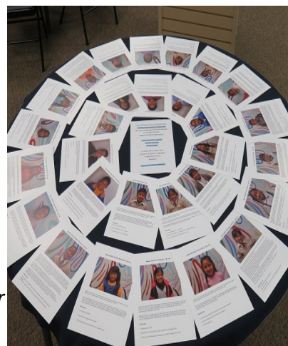
Adopt-A-Child Thru Prayer

We packed up again and moved into our second 'home' and then worked four 10-hour days preparing for our presentations. For the next two Sundays we would be at churches, setting up/tearing down, visiting with people in the foyer, presenting our mission, and answering questions. We set up several tables with hand-crafted items from Ecuador with the proceeds supporting those we minister to. We displayed Adopt-A-Child Thru Prayer photos/stories of 36 kids whose parents work in the trash-dump.