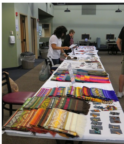
Sales Event of Ecuador Items

We packed up again and moved into our second 'home' and then worked four 10-hour days preparing for our presentations. For the next two Sundays we would be at churches, setting up/tearing down, visiting with people in the foyer, presenting our mission, and answering questions. We set up several tables with hand-crafted items from Ecuador with the proceeds supporting those we minister to. We displayed Adopt-A-Child Thru Prayer photos/stories of 36 kids whose parents work in the trash-dump.